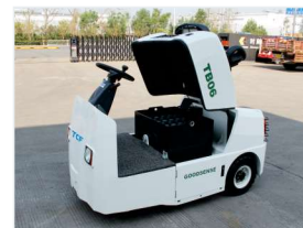
产品细节 Product Details